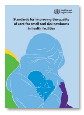
FIGURE 2: WHO'S STANDARDS FOR IMPROVING THE QUALITY OF CARE

The vertical scale-up of isolated nutrition interventions is insufficient to sustainably improve nutritional status. Nutrition interventions implemented within health systems are known to be more effective for improving health outcomes. The QoC MNCAH standards are a useful resource for advancing improved quality of nutrition MNCAH services for women and children. The following examples present early learning from selected QoC Network countries implementing efforts to improve quality health and nutrition services: